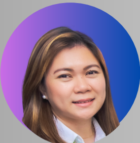
PEARL – FINANCE OFFICER