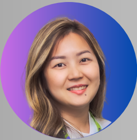
JELLY – CLIENT RELATIONSHIP COORDINATOR