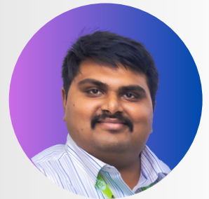
OPERATIONS OFFICER – SHENO